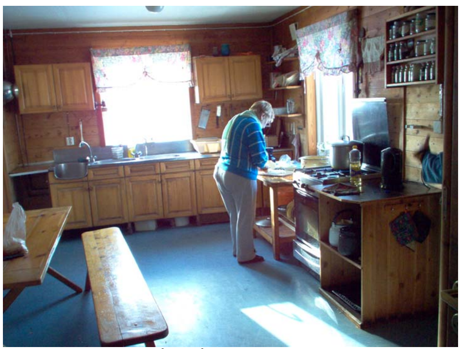
The Kitchen in Nansen House