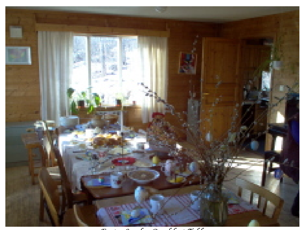
Easter Sunday Breakfast Table