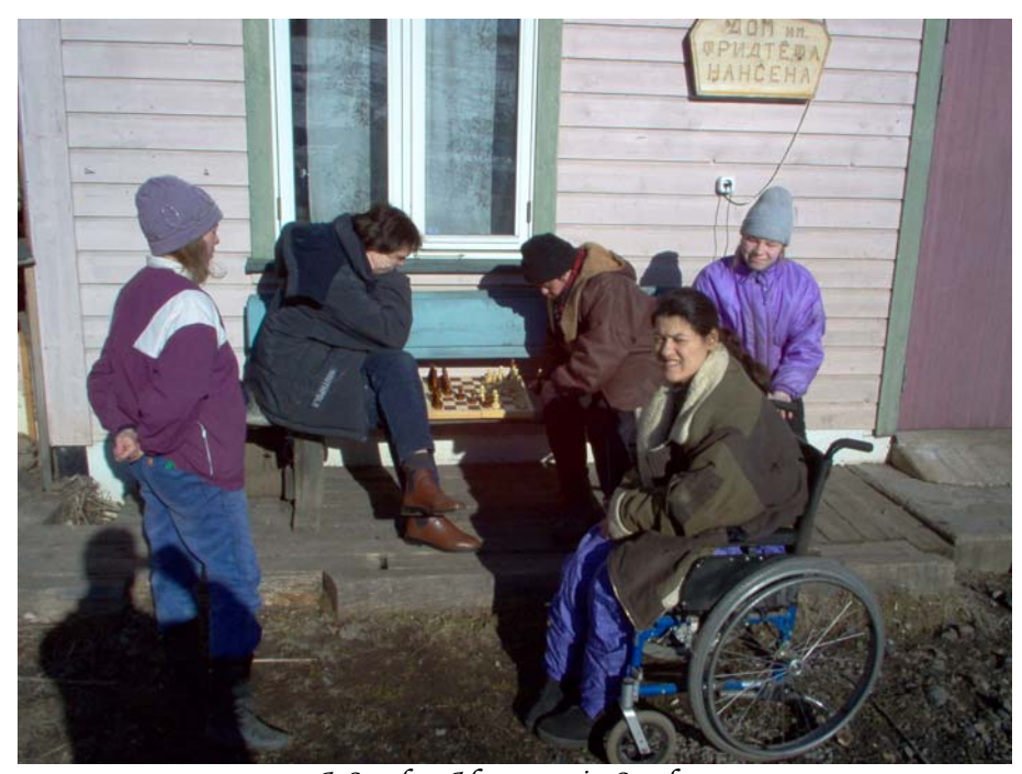
A Sunday Afternoon in Svetlana