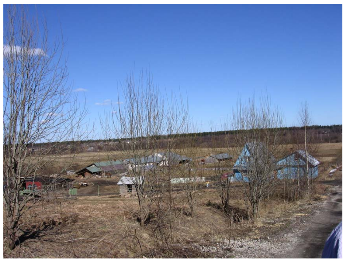
The first Days in Spring

And so with all the warmth and hope of a Russian Spring, let us wish you the traditional Orthodox Easter greeting: 'Christ is Truly Risen!'