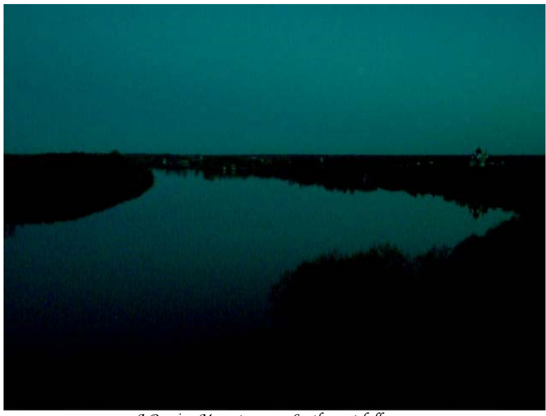
A Russian Monastery near Svetlana at full moon